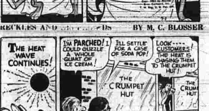
FLUID HEAT BY M. C. BLOSSER