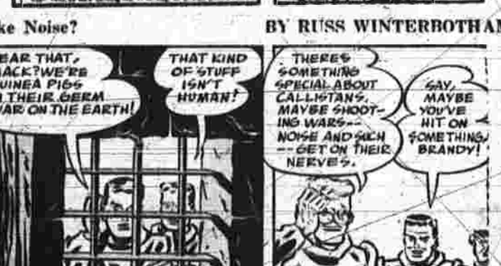
NO LIKE NOISE? BY RUSS WINTERBOTHAM