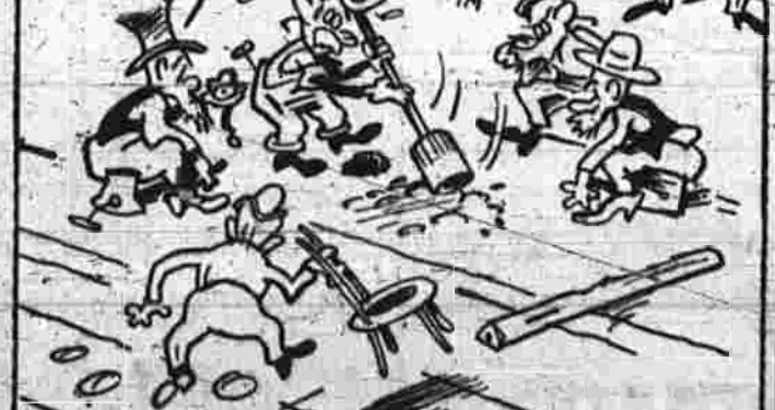
HAIR COOLED BY M. C. BLOSSER