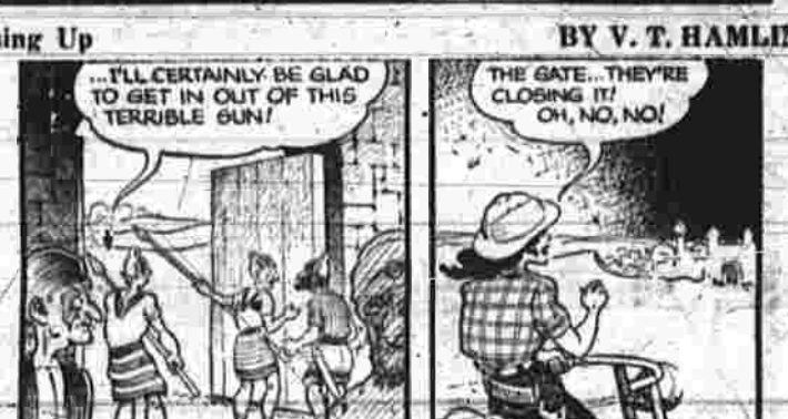
CLOSING UP BY V. T. HAMLIN