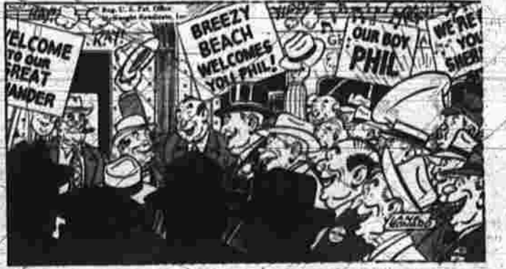
ON TIME BY FRANK LEONARD