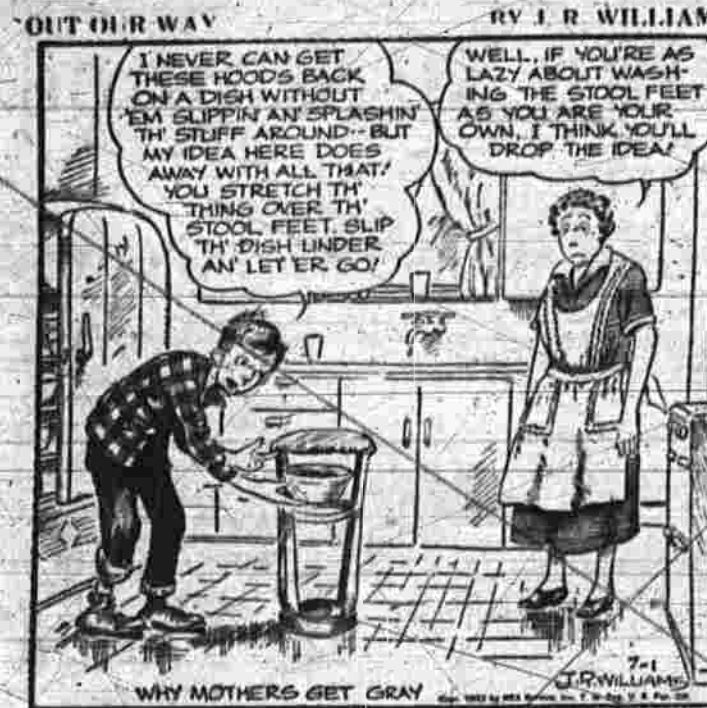
OUT OUR WAY BY R. WILLIAMS