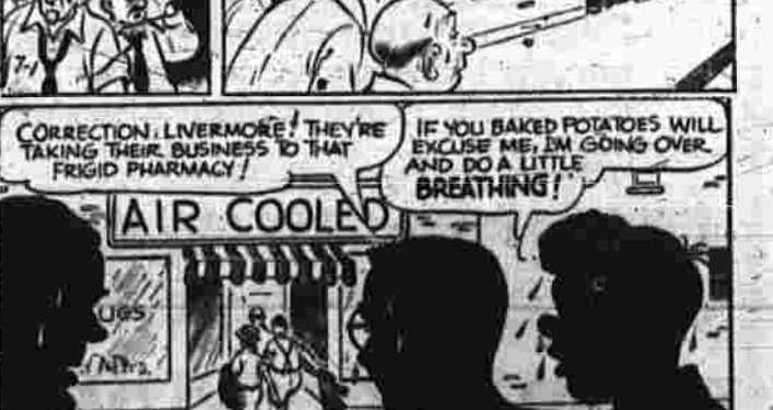
FLUID HEAT BY M. C. BLOSSER