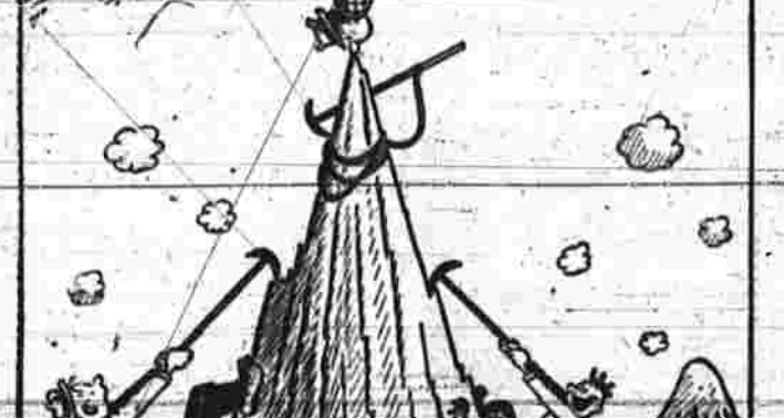
LOCAL AMUSEMENTS - POSTHOLE SUPERVISING BY FONTAINE FOX