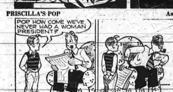
PRISCILLA'S POP BY AL VERMEER