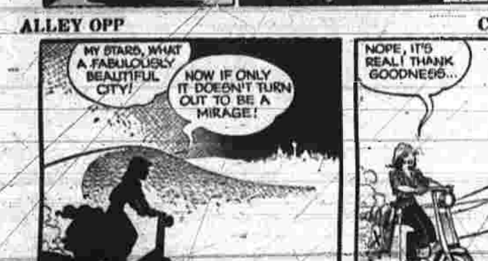
ALLEY OFF BY V. T. HAMLIN